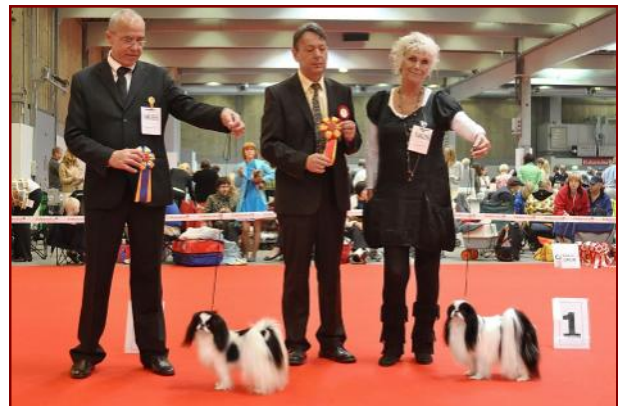
Int CH Roseheaven's Crown Princes and CH Roseheaven's Fabian Society World Winners 2010

My dogs are doing very well in the showing. They are shown all over Europe. Since the first Japanese Chin arrived in 1987, we have bred/owned more than 100 champions including about 50 international champions, several World winners, Europe winners and a lot of other titles.