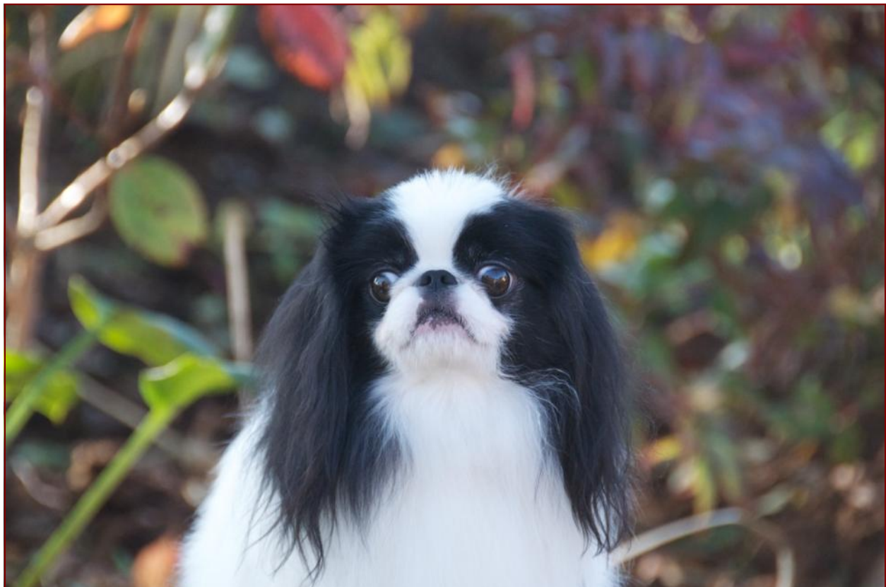
Below: Ch. Roseheaven's Banzai