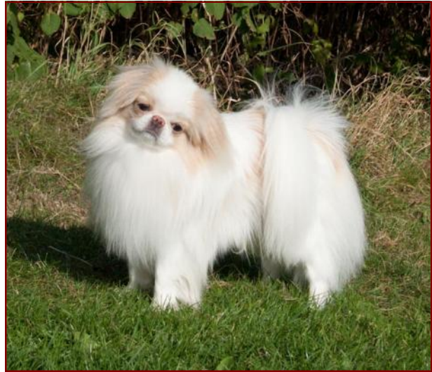
Above: Roseheavens Mala Conscientia Junior European Winner with BOB