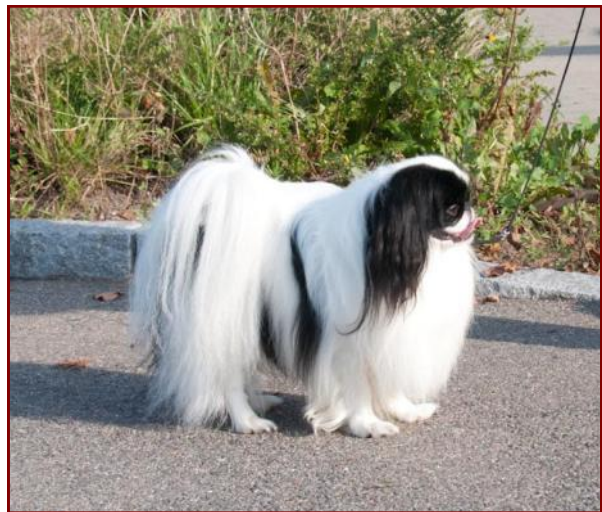
Int.Ch. Roseheaven`s Prins Fabian

Getting more and more involved in the breed; our fascination for the Sternroc Chins became bigger and bigger. At this time the Sternroc kennel was not an active breeder anymore, but we had a breeder in Denmark, who had some of these Sternroc lines. We bought a few puppies from her over a period. For some time we were line-breeding with the Sternroc and the Lotusgrange lines.