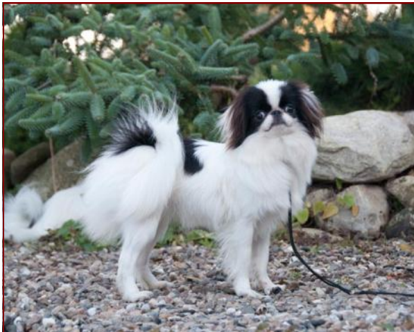
A young Roseheaven Chin

When planning a litter, I do a lot of research. Before I decide, I make "paper litters" to see the puppies' pedigree, and all the plusses and minusses will be put together. I can have several ideas, but very often it is the first choice with which I end up!